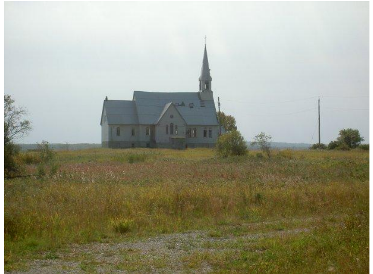
Infant Jesus Church