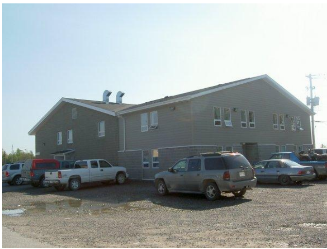
Long Lake #58 Band Office