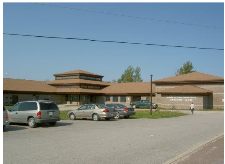
Migize Wazisin Elementary School

Grades JK/SK to grade 7 school follows Ontario curriculum. Sports & co-curricular activities offered. Special Education for students with learning exceptionalities offered through Program Support Department.