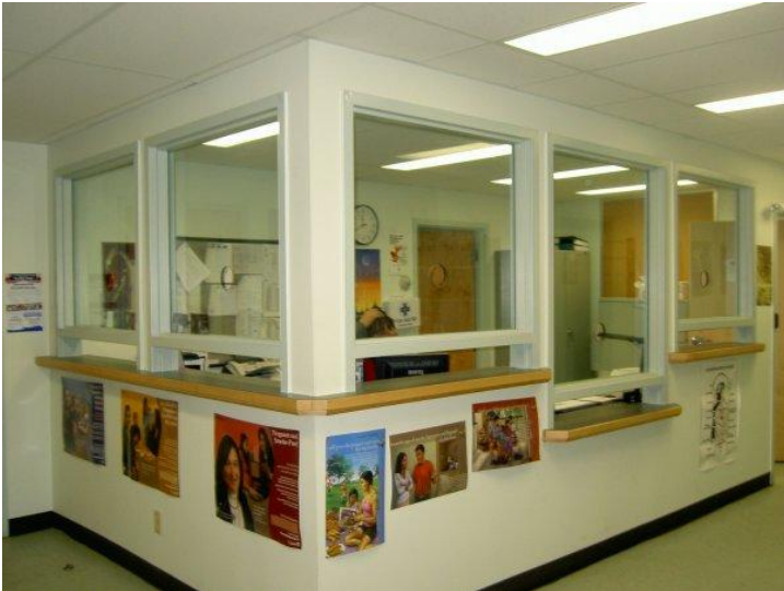
Health Centre Reception